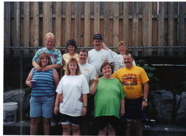
THE WHOLE GANG